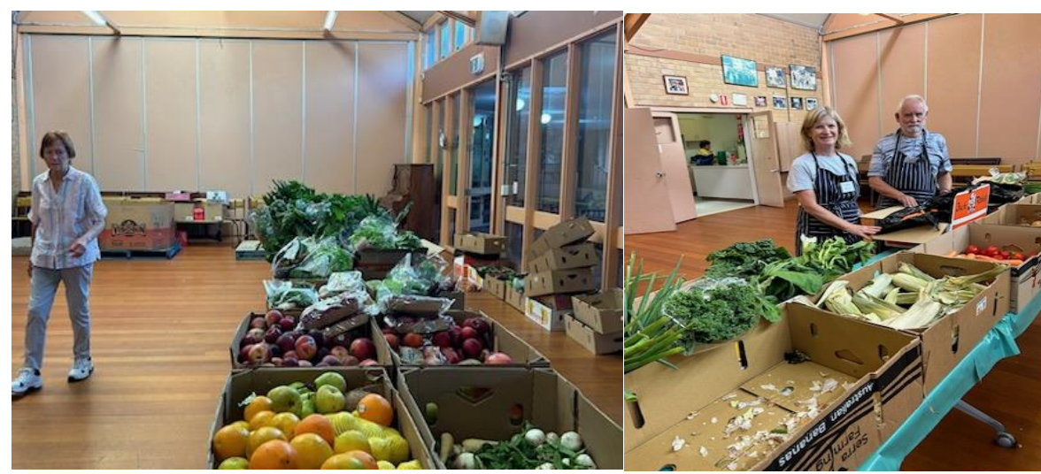
The Goodness Gracious Network spread for Friday mornings!

Each week about 6-7 volunteers serve and about 50-60 families that benefit from the food pantry as family members arrive each week. There seems to be an increasing need in the last 6 months.